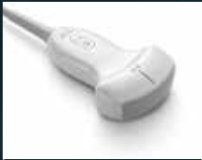
C5-1 ● 5-1 MHz Curved Scan Depth: 30 cm