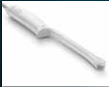
IC10-3 ● 10-3 MHz Curved Scan Depth: 15 cm

Abdomen, Gynecology, Lung, Nerve, Musculoskeletal, Early Obstetrics, Obstetrics, Spine