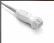
P5-1 5-1 MHz Phased Scan Depth: 35 cm

Arterial, Breast, Carotid, Musculoskeletal, Nerve, Superficial, Venous