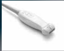
L19-5 ●● 19-5 MHz Linear Scan Depth: 6 cm

Gynecology, Early Obstetrics, Obstetrics