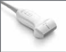
L12-3 ● 12-3 MHz Linear Scan Depth: 9 cm