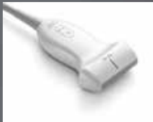
L15-4 ● 15-4 MHz Linear Scan Depth: 6 cm

Arterial, Breast, Carotid, Lung, Musculoskeletal, Nerve, Ophthalmic, Superficial, Venous